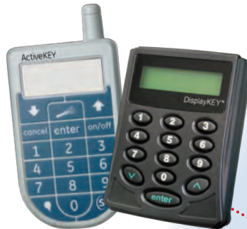
Works with any Supra key

Simple one-step shackle release for easy placement on properties