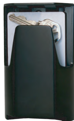
Roomy key container accommodates gate cards